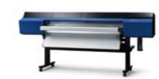
DU2-64 [For VG2-640] Power requirements AC 100 to 120 V ±10%, 5.5 A, 50/60 Hz AC 220 to 240 V ±10%, 3 A, 50/60 Hz DU2-54 [For VG2-540] Power requirements AC 100 to 120 V ±10%, 5 A, 50/60 Hz AC 220 to 240 V ±10%, 2.6 A, 50/60 Hz

*It is recommended to use heater and blower especially for printing with white.