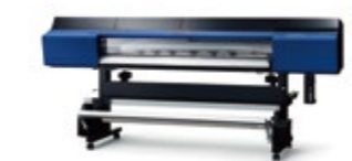
TU4-64 [For VG2-640] TU4-54 [For VG2-540] * Rolls up to 40 kg (88.2 lb.)