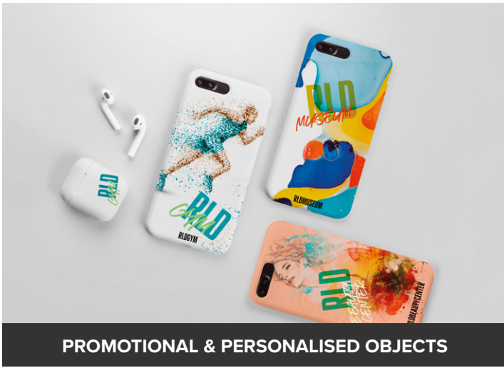
PROMOTIONAL & PERSONALISED OBJECTS