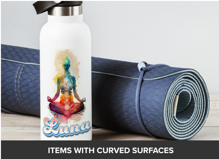
ITEMS WITH CURVED SURFACES