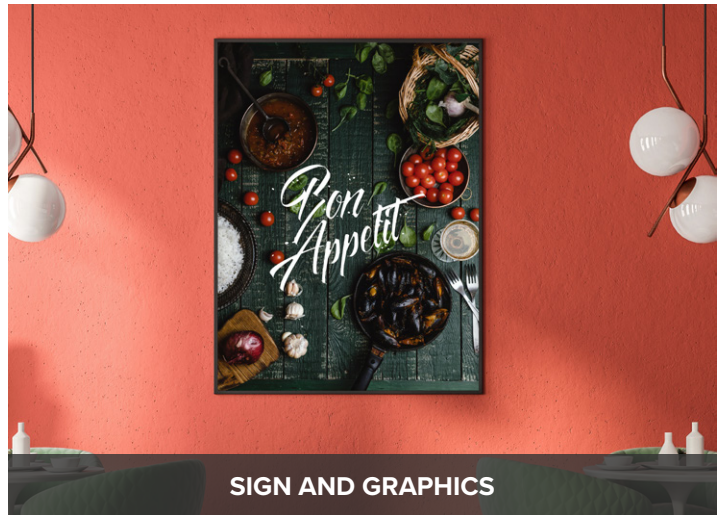
SIGN AND GRAPHICS