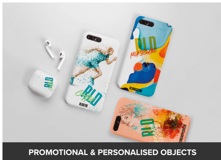
PROMOTIONAL & PERSONALISED OBJECTS