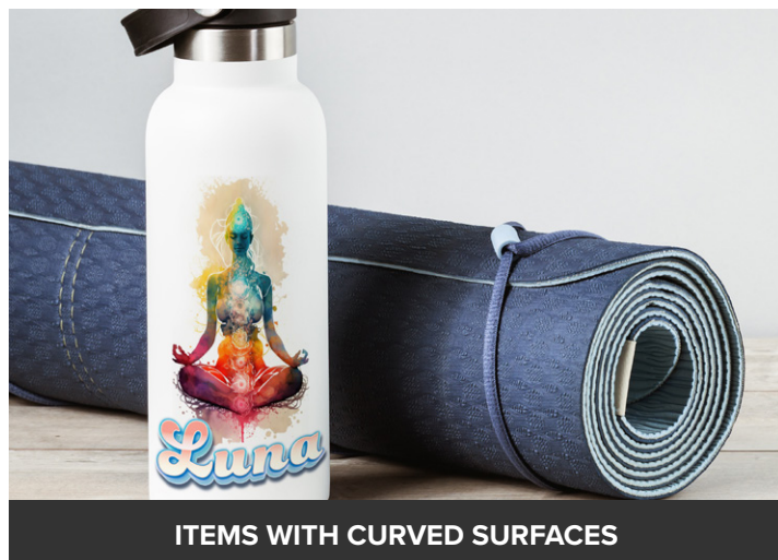
ITEMS WITH CURVED SURFACES