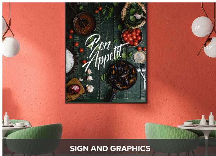
SIGN AND GRAPHICS